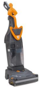
TASKI Swingo 150E

TASKI Auto Scrubbers are designed to clean, scrub, and pick up in small and large areas. Quiet, Effective, and Sustainable.