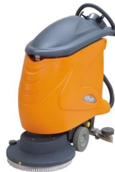
TASKI Swingo 855B