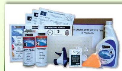
The Laundry Stain Spotter Kit

Janitorial Professionals have to efficiently remove tough stains from a variety of building and furniture surfaces on a daily basis. They are usually equipped with a stable of commercial cleaning equipment, and they are trained to use an array of specialty stain removal chemicals, to quickly and efficiently solve their problems.