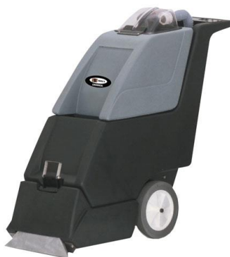
SSS (Triple S) Achiever 110 Carpet Stain & Soil Extractor

SSS (Triple S) produces an excellent range of heavy-duty janitorial cleaning equipment including commercial vacuum cleaners, carpet cleaners, floor machines... and is renowned for providing excellent value.