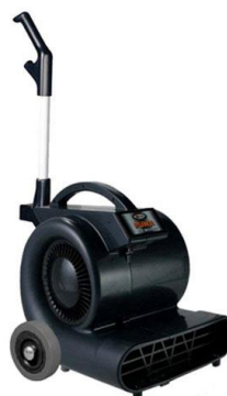
SSS (Triple S) Puma Air Mover Optional Transport Kit Available