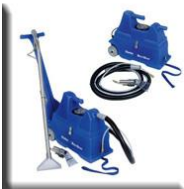
Clarke BextSpot Std & Deluxe Carpet Spotters

Clarke is a division of Nilfisk-Advance Group, renowned for its' range of high quality heavy-duty commercial cleaning equipment. Clark commercial vacuum cleaners, carpet cleaners, floor machines... are built to perform and last in the toughest commercial, institutional, & industrial cleaning applications.