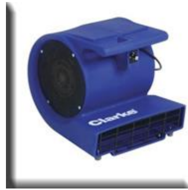
Clarke DirectAir Carpet Dryer / Air Mover