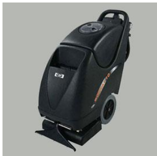
SSS (Triple S) Bobcat 10 Extractor For Cleaning Carpets & Rugs

The janitorial professional usually faces a much more difficult job than the homeowner when removing stains from carpets & rugs: