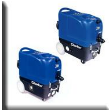
Clarke BEXT 150H & 300HV Carpet Water Extractors