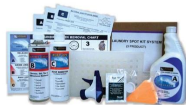
Laundry Stain Removal Spotter Kit Also Removes Stains From Carpets & Rugs

In this situation, most stains can be effectively and permanently removed if immediate action is taken to treat them correctly. In most cases this simply requires that the homeowner have access to the Laundry Stain Removal Spotter Kit referenced in SECTION 1 of this guide, and that they follow the simple directions for use of this inexpensive and easily maintained kit in removal of stains from carpets & rugs. Stains that have been allowed to set and dry in are usually more difficult to remove, and may require professional treatment as outlined below.