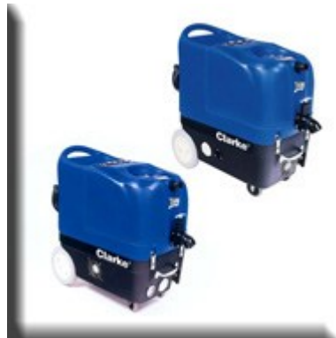
Clarke BEXT 150H & 300HV Carpet Water Extractors