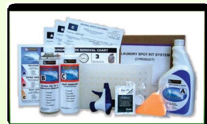
The Laundry Stain Spotter Kit

Janitorial Professionals have to efficiently remove tough stains from a variety of building and furniture surfaces on a daily basis. They are usually equipped with a stable of commercial cleaning equipment, and they are trained to use an array of specialty stain removal chemicals, to quickly and efficiently solve their problems.