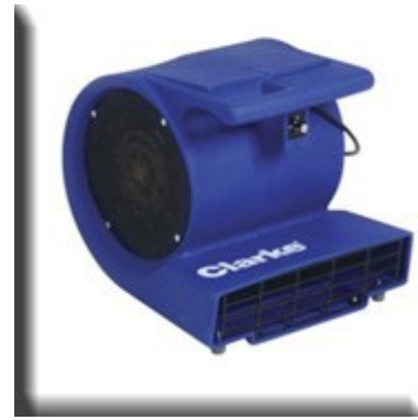
Clarke DirectAir Carpet Dryer / Air Mover