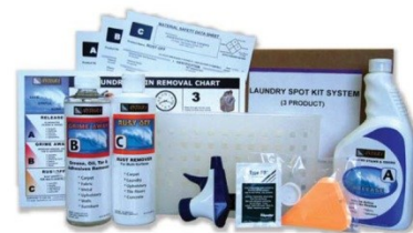
Laundry Stain Removal Spotter Kit Also Removes Stains From Carpets & Rugs

In this situation, most stains can be effectively and permanently removed if immediate action is taken to treat them correctly. In most cases this simply requires that the homeowner have access to the Laundry Stain Removal Spotter Kit referenced in SECTION 1 of this guide, and that they follow the simple directions for use of this inexpensive and easily maintained kit in removal of stains from carpets & rugs. Stains that have been allowed to set and dry in are usually more difficult to remove, and may require professional treatment as outlined below.