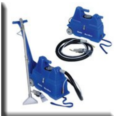
Clarke BextSpot Std & Deluxe Carpet Spotters

Clarke is a division of Nilfisk-Advance Group, renowned for its' range of high quality heavy-duty commercial cleaning equipment. Clark commercial vacuum cleaners, carpet cleaners, floor machines... are built to perform and last in the toughest commercial, institutional, & industrial cleaning applications.